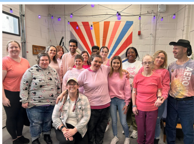
Pink Shirt Day